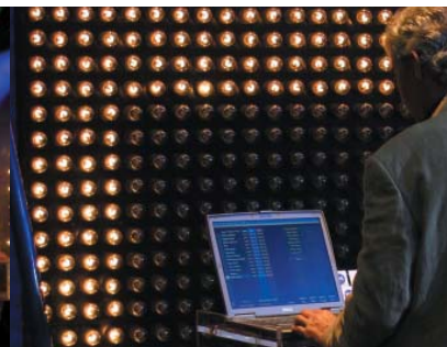
Demonstration at PLASA 2005

© TMB. All Rights Reserved. Specifications subject to change without notice. LITFESTOON-010406