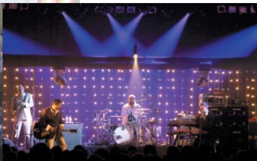
Festoon in action