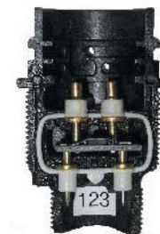
Two core festoon cable supplies power to individually addressed lamp holders for maximum creativity