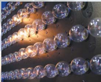
Innovative lamp operation

The hand held programmer also verifies correct lamp unit operation.